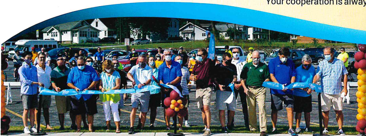
Official ribbon-cutting for Pennsy Trail phases 2 & 3