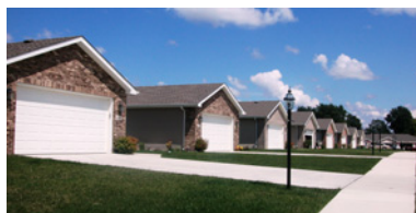
DISCOURAGE ARCHITECTURAL FEATURES THAT OVERWHELM THE RESIDENTIAL STREETScape