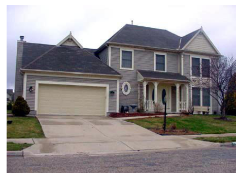
EXAMPLES OF ACCEPTABLE HOUSING VARIATIONS