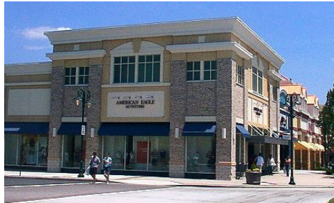
ENCOURAGE RETAIL CENTERS AT MAJOR INTERSECTIONS