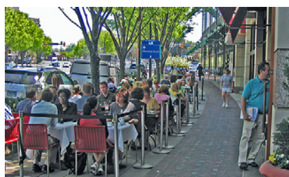
DESIGNS THAT ALLOW FOR A WIDE VARIETY OF ACTIVITIES ALL DAY