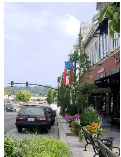
INCORPORATE LANDSCAPING IN PARKING AREAS