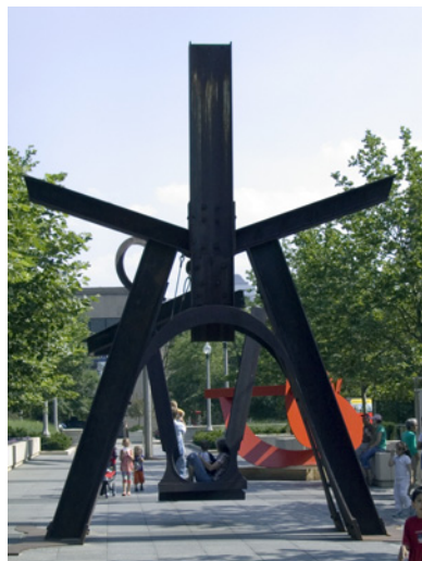
ENCOURAGE PUBLIC ARTS ALONG SCHERERVILLE'S CORRIDORS