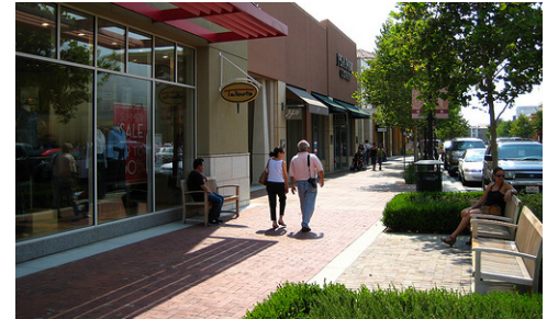
MAINTAIN NEIGHBORHOOD CHARACTER AND SCALE