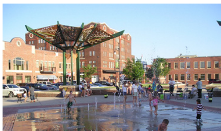
DOWNTOWN PLAZA CONCEPT