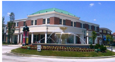
DEVELOP CLEAR FOCAL POINTS THAT ARE WITHIN WALKING DISTANCE FROM NEIGHBORHOODS