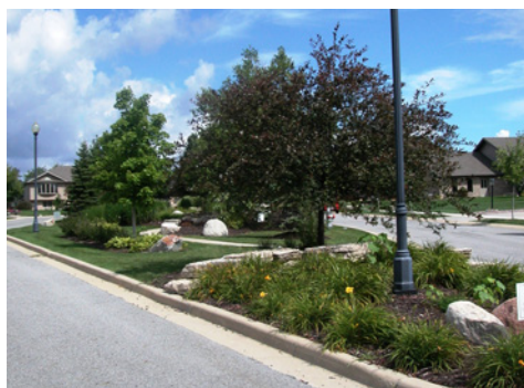
EXAMPLE OF OPEN SPACE IN A RESIDENTIAL CUL-DE-SACS