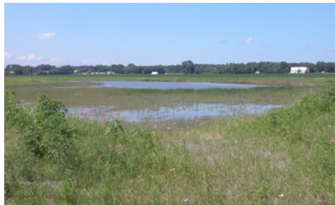
PROTECT ENVIRONMENTALLY SENSITIVE AREAS, SUCH AS THE TURKEY CREEK NATURAL AREA