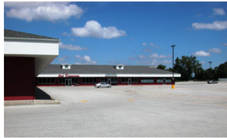
EXAMPLE OF STRIP CENTER DEVELOPMENT TO BE DISCOURAGED