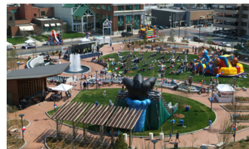
CONCEPT FOR A CIVIC PARK