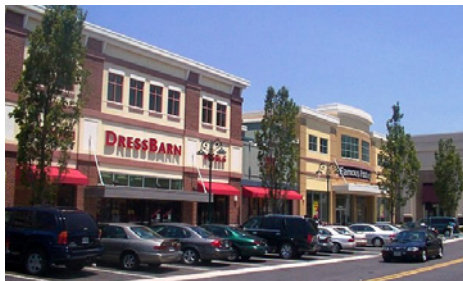
ENCOURAGE MIXED USE DEVELOPMENTS WITH A VARIETY OF USES