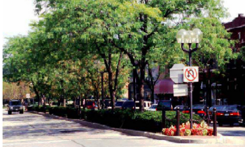
DEVELOP PARALLEL ROADS ALONG SIDE MAJOR CORRIDORS