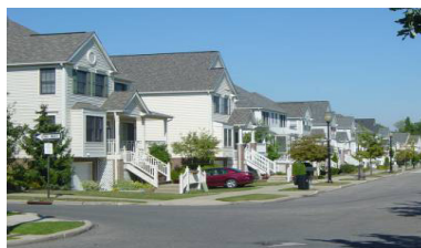
ENCOURAGE PLANNED RESIDENTIAL VARIETY AND INTERCONNECTIVITY