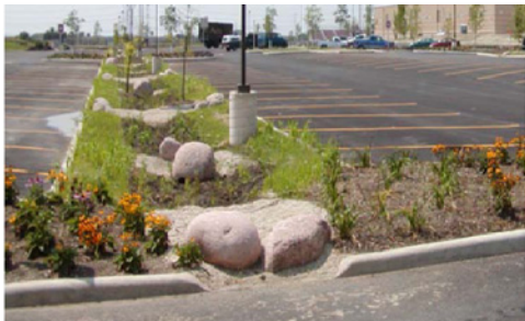
ENCOURAGE SUSTAINABLE PRACTICES, SUCH AS THIS PARKING LOT RAIN GARDEN