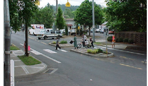
DESIGN STREETS SUITABLE FOR PEDESTRIANS AND ALTERNATIVE MODES OF TRANSPORTATION