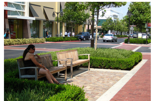
INCORPORATE PUBLIC SPACES IN ALL DEVELOPMENTS, SUCH AS THIS STREETScape