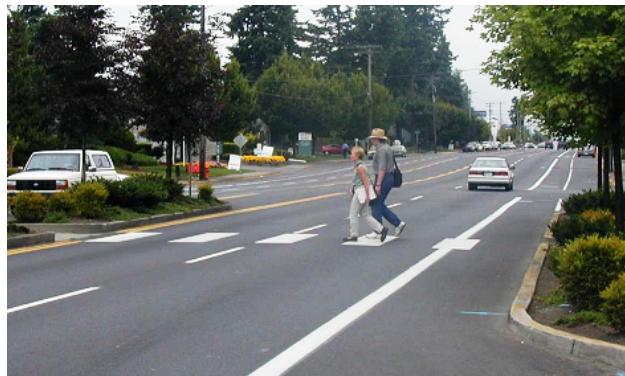
INVEST IN TOTAL STREETScape IMPROVEMENTS