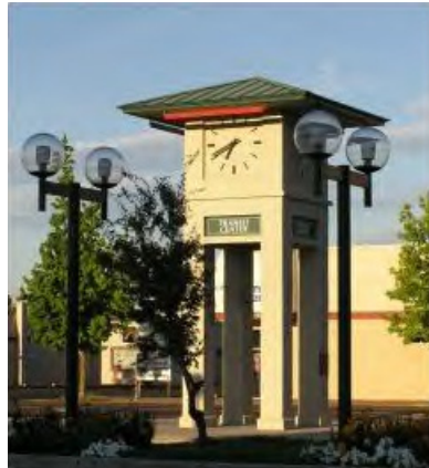
CLOCKTOWER USED AS A DISTINCT ENTRY MARKER