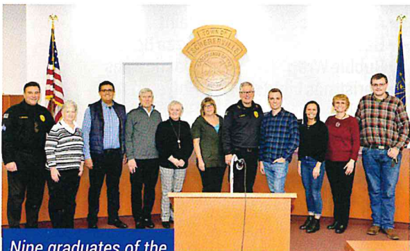
Nine graduates of the Citizen's Police Academy were honored November 22 during a ceremony at the Schererville Police Department.

Law enforcement involves many important duties, and nine Schererville residents recently gained insight into the workings of their police department and what new technologies the department has to offer during the 9-week Citizen's Police Academy.