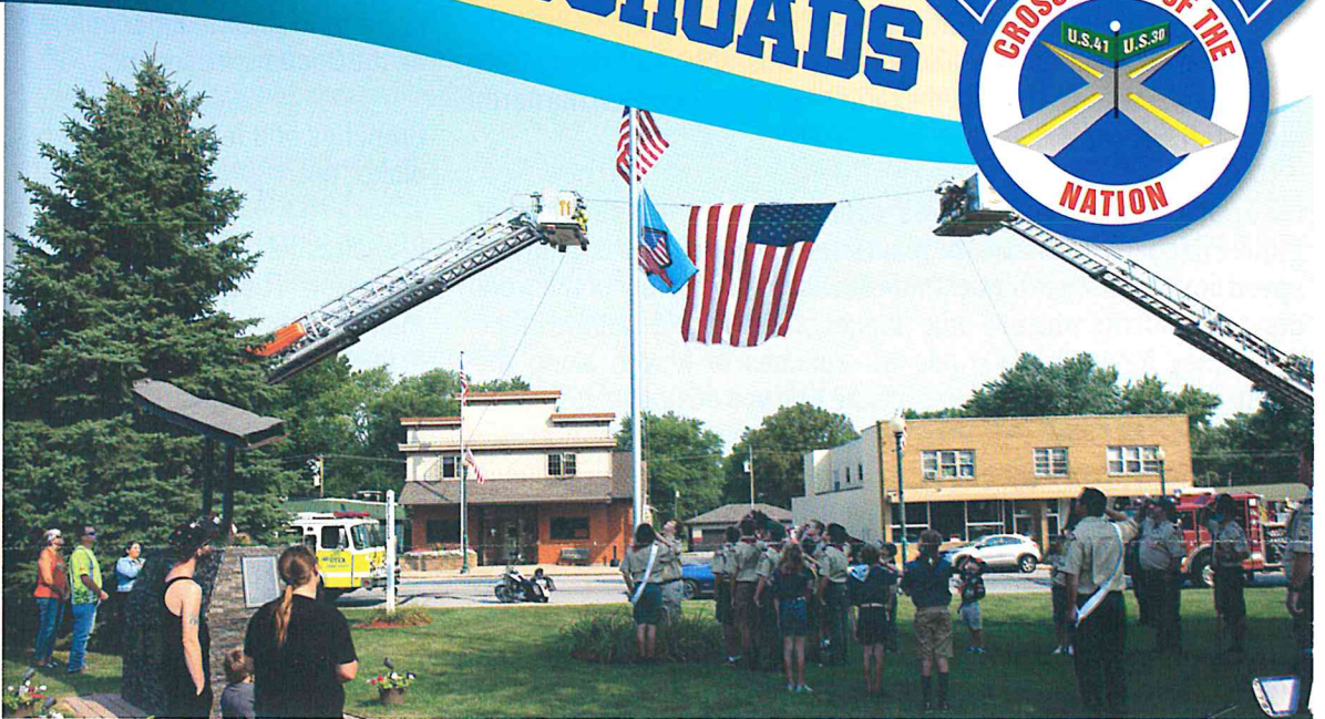
Boy Scout Troop flag raising