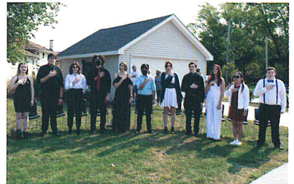
Lake Central Counterpoints choir

The Lake Center Counterpoints – 11 students from Lake Central High School – lifted their voices to sing the National Anthem and in an